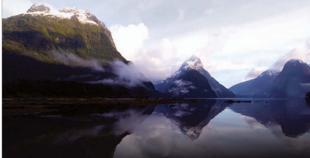
Mitre Peak, Milford Sound